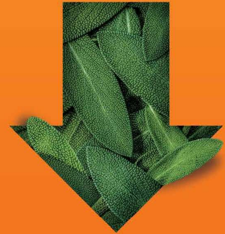
Reduce Our Footprint